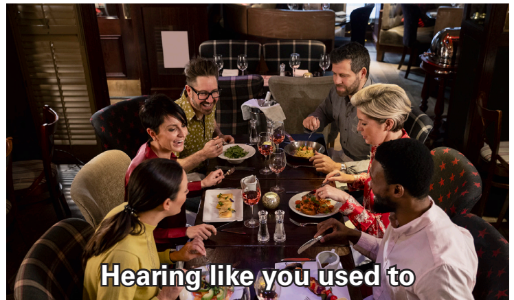
Hearing like you used to

Here's the truth (and nothing but the truth): tinnitus is treatable . It is not curable, and it can not be helped by magical pills. However, with proper treatment, the experience of tinnitus can be dramatically changed, perhaps to a point where you don't even notice it anymore. Because everybody's experience with tinnitus is unique, I always recommend asking your hearing healthcare specialist if treatment is right for your tinnitus.